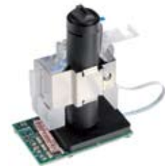
HP Optical Media Advance Sensor